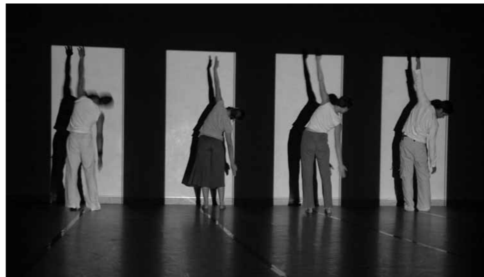
Top: photo courtesy Attakkalari Centre for Movement Arts

Expressions of interest are due 13 February.