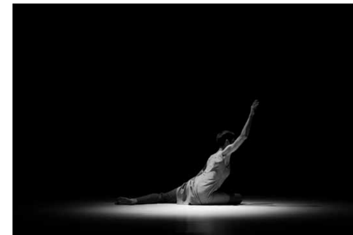
Renate Graziadei.