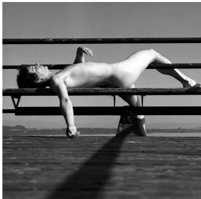
Footwa d'Imobilité.

Masterclass 11am – 1pm, 3, 4 & 6 Oct Screening 3 Oct 7:30pm Studio showing 6 Oct 7:30pm Drill Hall